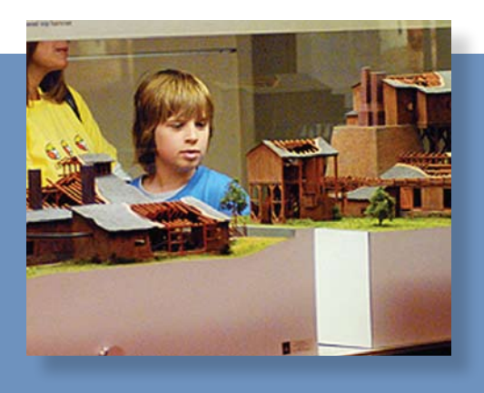
A field trip to the museum provides online students an opportunity to learn about the history of industry in their region.

Online collaboration also allows for new and different types of academic programs. For example, Michigan Virtual School established a new academic program in 2007, Online Scholars Community Advanced Research