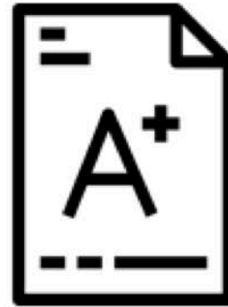
Grades & Credit