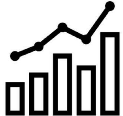
Data & Efficacy